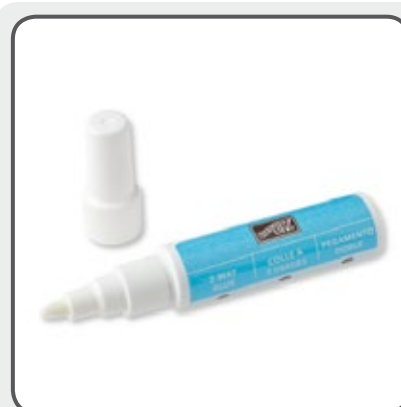
2-Way Glue Pen