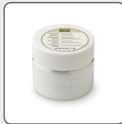
Dazzling Diamonds Stampin' Glitter