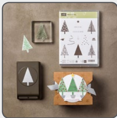
Festival of Trees Bundle