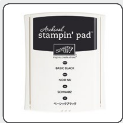
Basic Black Archival Stampin' Pad