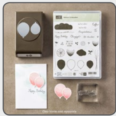
Balloon Celebration Bundle